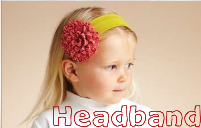
Headband and Flower