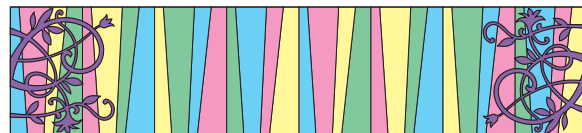
TABLE RUNNER VIEW B

Notions: Thread, paper-backed fusible web, tear-away material. Optional fleece or other inner lining: One 16 1/2" x 72 1/2" (42 cm x 184 cm) piece.