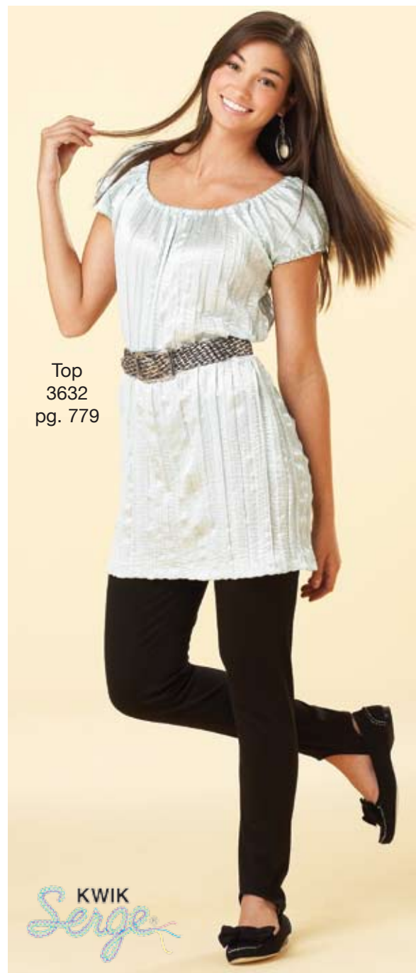
Top 3632 pg. 779